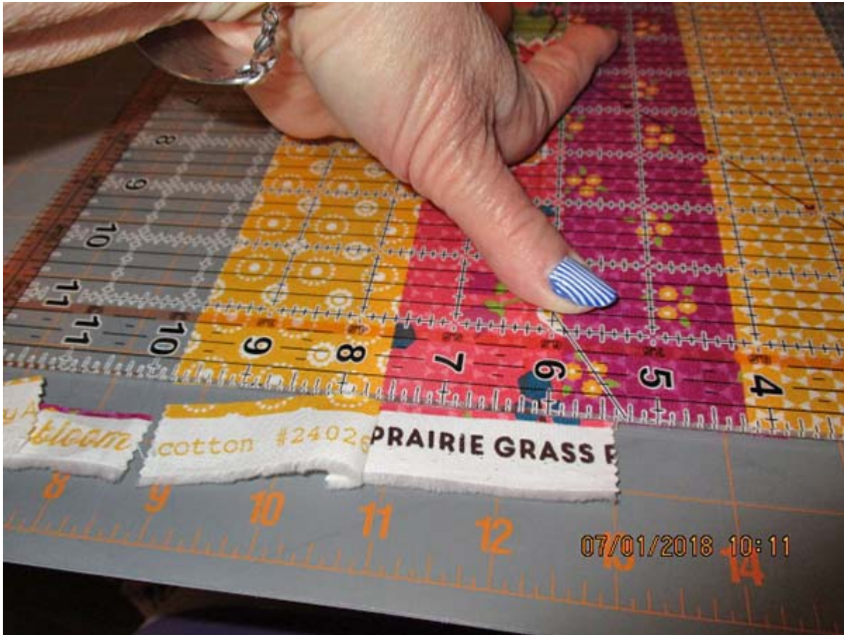
▪ Cutting the Strips into squares