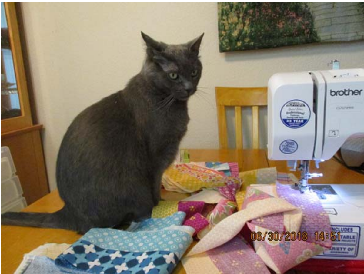
▪ Trimming the strips.