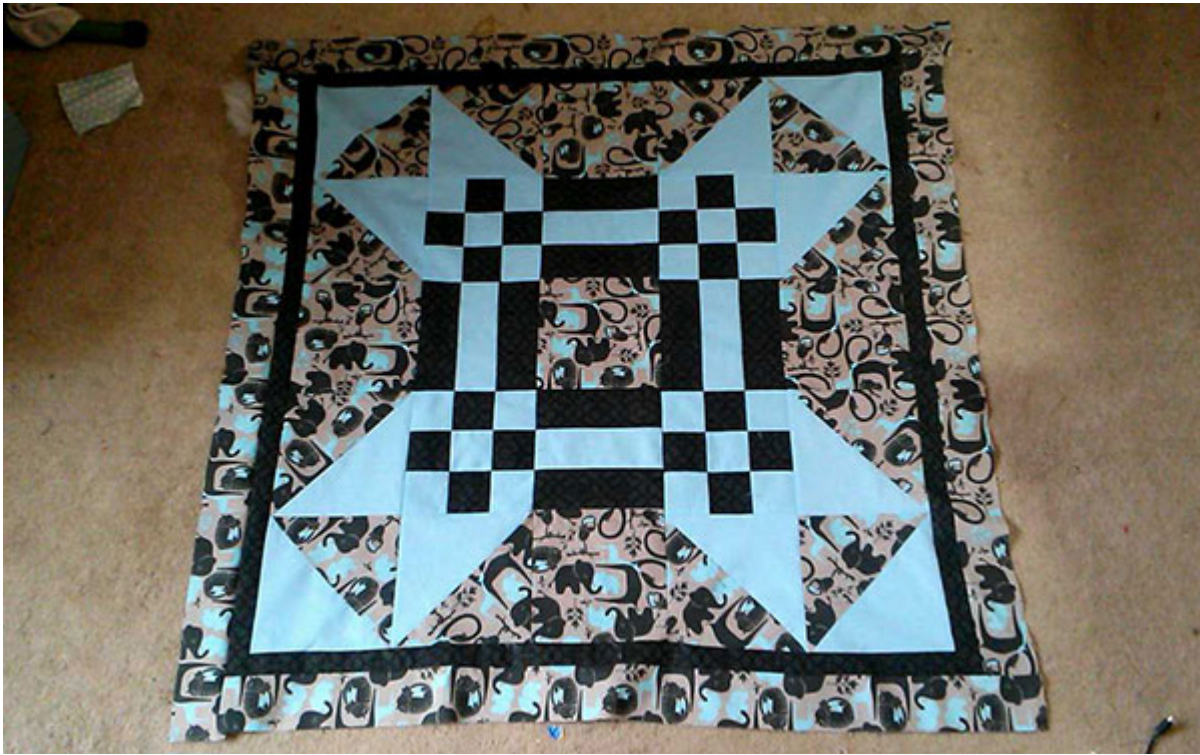
▪ The reverse side of quilt.