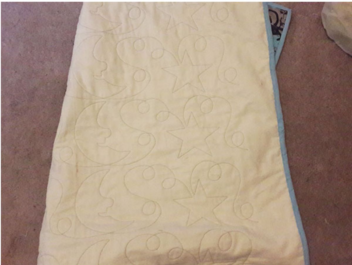
▪ The front side quilted and finished with hand binding.